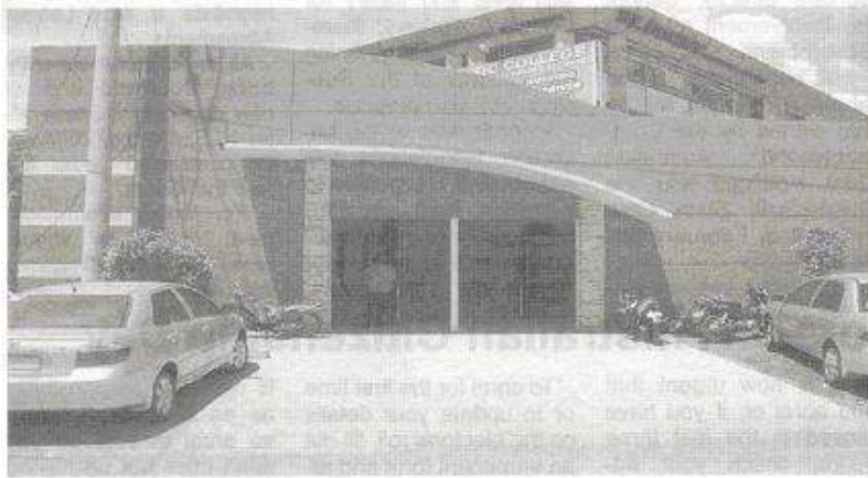
St. Dominic College of Arts and Sciences in Cavite, Philippines.